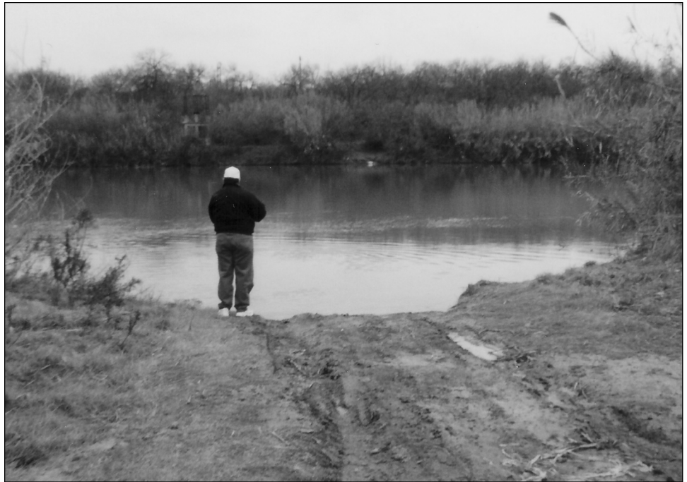
Figure 4: GAO Investigator at a U.S.–Mexico Border Location