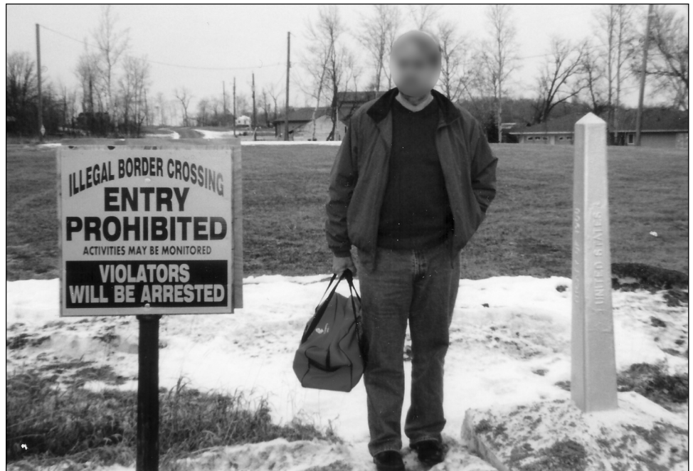
Figure 2: GAO Investigator Crossing from Canada into the United States in Northern Border Location Three

On November 15, 2006, our investigators visited an area in this state where state roads ended at the U.S.–Canada border. One of our investigators simulated the cross-border movement of radioactive materials or other contraband by crossing the border north into Canada and then returning to the United States (see fig. 2). There did not appear to be any monitoring or intrusion alarm system in place at this location, and there was no U.S. Border Patrol response to our border crossing.