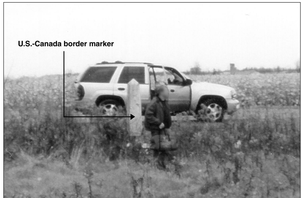
Figure 1: GAO Investigator Crossing from Canada to the United States in Northern Border Location One

the investigators on the U.S. side, and returned to his vehicle on the Canadian side (see fig. 1).